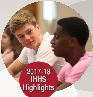
2017-18 IHSS Highlights

Prepare students of the Indian Hill Exempted Village School District to understand and prosper in a diverse global community to successfully lead, engage, and serve others.